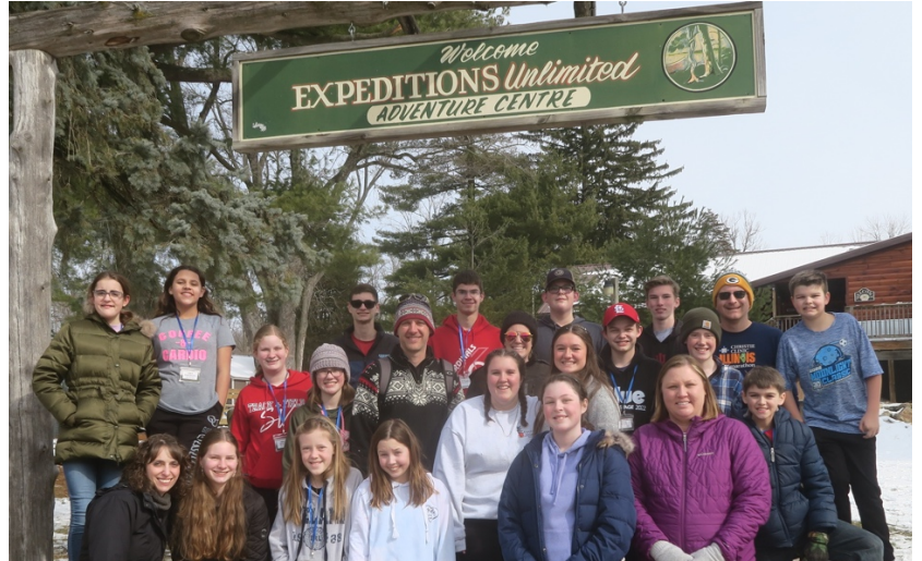
Red Brick Church at Winter Camp 2023