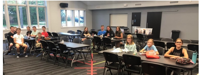
Youth Bible Study, Wednesday nights from 7 to 8