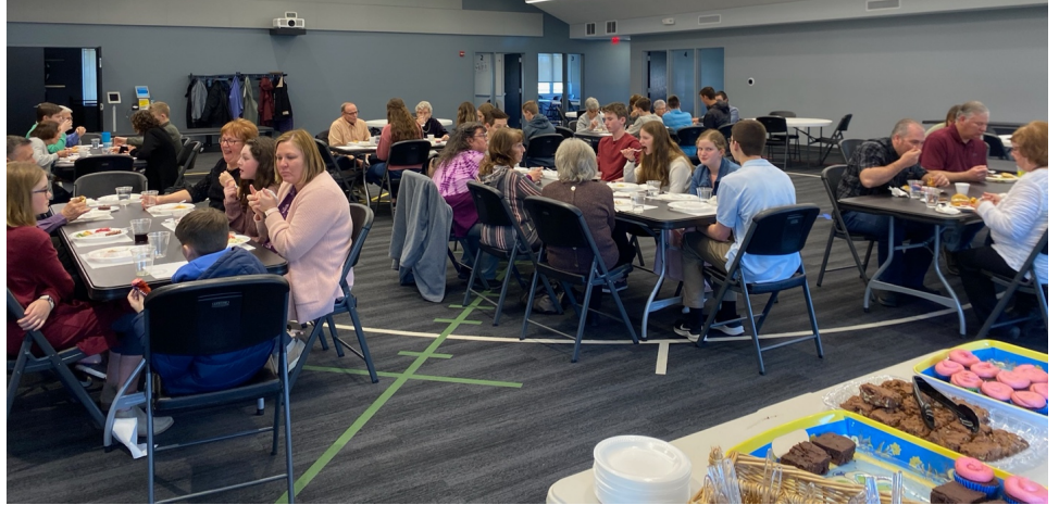
The Brick Center bustled with activity during the afternoon of April 3 rd , 2022. Bricks of all ages gathered for fellowship food, and fun as we hosted our first "Around the Table with Seniors and Teens" since the Fall of 2019.

We are using a changeup of sorts to deepen our walks with Jesus during the fast-paced final weeks of the school year. Many of our youth served the younger children in AWANA this year. Now they will have a chance to slow down on Wednesday nights, gather for a little longer, and focus on three specific disciplines: Scripture memory, worship in song, and outreach.