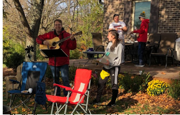
Pie Gladiators in the back; worship leaders in the front.

Wisdom is what we seek to exercise as we navigate the days, weeks, and even months ahead. As the weather turns, we are spending more time indoors and community spread of the coronavirus (along with normal fall-winter illnesses) is increasing. We also find ourselves making adjustments to plans. Most notably, group sizes will be smaller, meeting lengths shorter, and adherence to pandemic disciplines such as distance and masks will be a part of our witness to the world.