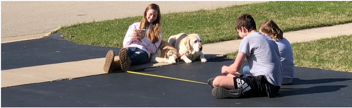
Social Distancing Driveway Visits

Let us not shrink back as disciples of Jesus. We press onward, to learn the truths He is teaching us. We find ways to creatively serve others safely, for their sake and ours. We continue to leverage technology to nurture relationships in the Body of Christ: phone calls, video meetings, and messaging. I saw a meme that had a picture of an empty church sanctuary. It simply said, "The church is not empty. The Church is deployed."