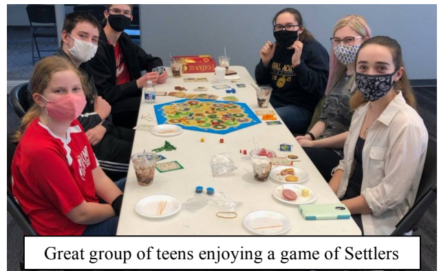
Great group of teens enjoying a game of Settlers

Our youth continued a beautiful tradition of ministering to the widows of The Red Brick Church over Valentine's Day weekend. On Friday night, many gathered to make cards and prepare flower bouquets. During the day of Saturday, February 13, several families braved the snow and cold to deliver care packages that included the cards, flowers, and a sweet treat.